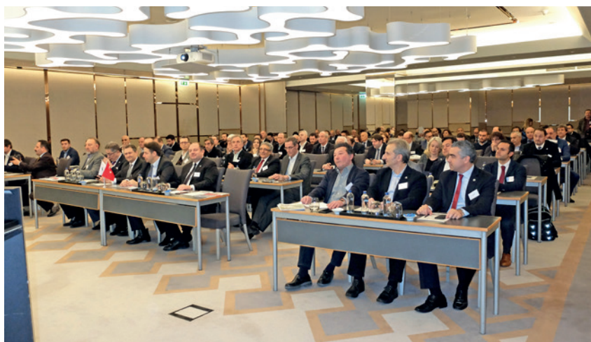
More than 100 carton Turkish converters attended the recent KASAD meeting.

Moving on to converting, Sparbert shared information on the Rapida RDC 106 rotary die-cutting machines. Introduced at Drupa 2016, the RDC 106 is based on the well-proven Rapida 106 offset press platform and uses the feeder and delivery units from the printing press. It is very quick to make-ready (less than 5 minutes) and is capable of cutting, creasing and embossing at up to 17,000 sheets/hour on a wide range of materials from in-mould labels to 0.7mm board,